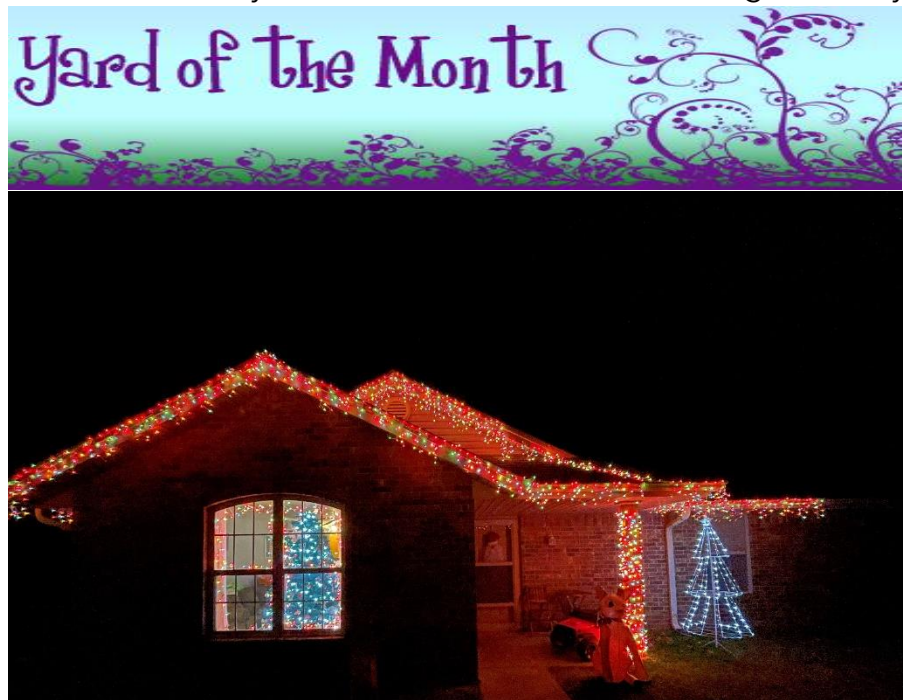
December Low Rent