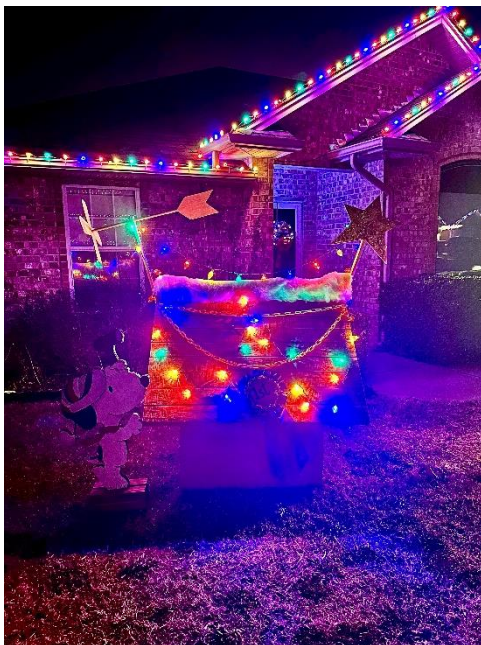
December Lease Option

This year's Yard of the Month winners will be chosen in April, May, June, July, August, September, October, and December. Remember, neat and clean yards, seasonal décor, landscaping, flowers, etc. are areas that are taken into consideration for the yard of the month winner. Prizes are awarded to winners. To nominate yourself or other HASFN tenants for yard of the month, call the Housing Authority at (405) 275-8200.