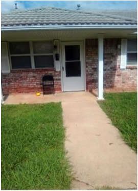
July Low Rent

Yard of the Month is wrapping up for this season. You still have time to showcase your yard and win the prize for October and December. Next year's Yard of the Month winners will be chosen in April, May, June, July, August and September. Remember, neat and clean yards, seasonal décor, landscaping, flowers, etc. are areas that are taken into consideration for the yard of the month winner. Prizes are awarded for winners. To nominate yourself or other HASFN tenants for yard of the month, call the Housing Authority at (405) 275-8200.