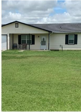
July Lease Option