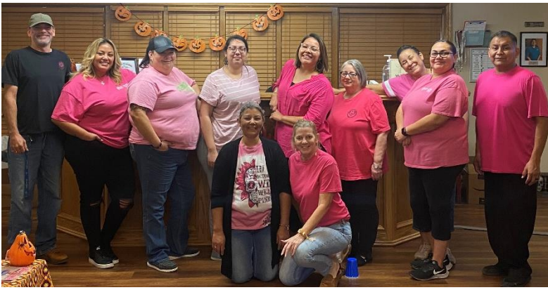
HASFN Employees wear pink in support of Breast Cancer Awareness.