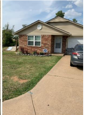
September Lease Option