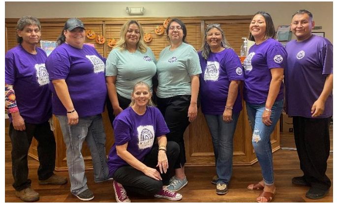
HASFN Employees wear purple in support of Domestic Violence Awareness.