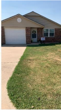
August Lease Option