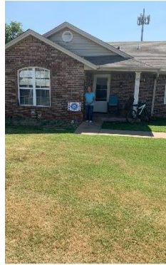
August Low Rent