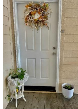
September Low Rent