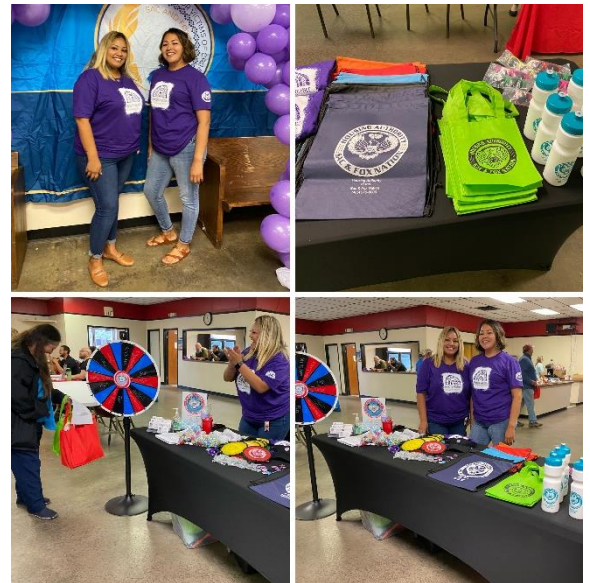
HASFN Employees attended the Domestic Violence Awareness Fair at the Sac and Fox Nation Community Building.